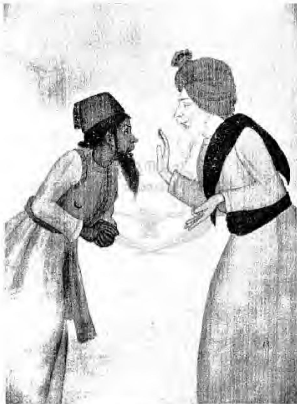
"His countenance rather betrayed his inward feelings."